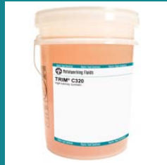
5-gallon pail SKU: C320-5G UPC-12: 641238031659