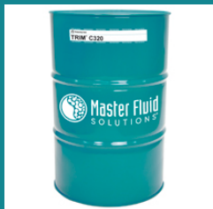
54-gallon drum SKU: C320-54G UPC-12: 641238031666