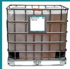
270-gallon tote SKU: C320-270G UPC-12: 641238033851