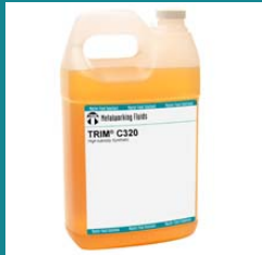
1-gallon jug SKU: C320-1G UPC-12: 641238031635