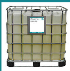
270-gallon tote SKU: CL2030-270G UPC-12: 641238042570

Master STAGES™ CLEAN 2030 | ©2005-2024 Master Fluid Solutions® | 2024-04-20