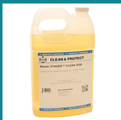
1-gallon jug SKU: CL2030-1G UPC-12: 641238042518