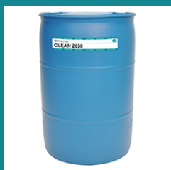
54-gallon drum SKU: CL2030-54G UPC-12: 641238042556