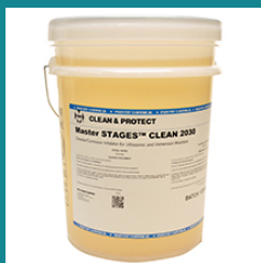
5-gallon pail SKU: CL2030-5G UPC-12: 641238042532