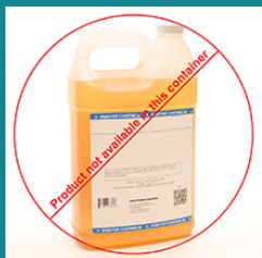
1-gallon jug SKU: CLEANAMO-1G UPC-12: 641238070764