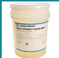
5-gallon pail SKU: CLAMO-5G UPC-12: 641238039280