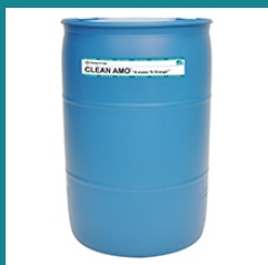
54-gallon drum SKU: CLAMO-54G UPC-12: 641238039310