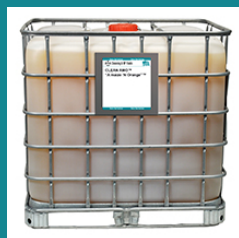
270-gallon tote SKU: CLAMO-270G UPC-12: 641238069195

Master STAGES™ CLEAN AMO™ | ©2004-2024 Master Fluid Solutions® | 2024-04-20