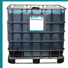
270-gallon tote SKU: MS606BD-270G UPC-12: 641238038504