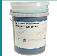
5-gallon pail SKU: MS606BD-5G UPC-12: 641238038450