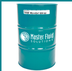
54-gallon drum SKU: MS606BD-54G UPC-12: 641238038467