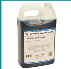
1-gallon jug SKU: MS606BD-1G UPC-12: 641238038443