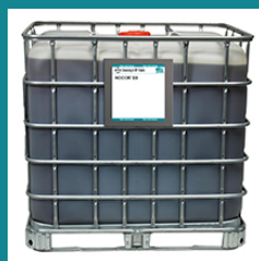
270-gallon tote SKU: NOCORE6-270G UPC-12: 641238042389