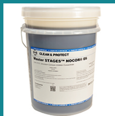
5-gallon pail SKU: NOCORE6-5G UPC-12: 641238042334