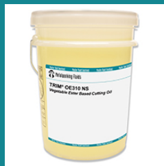
5-gallon pail SKU: OE310NS-5G UPC-12: 641238077473