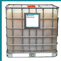
270-gallon tote SKU: OE310NS-270G UPC-12: 641238077510