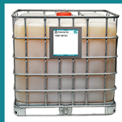
270-gallon tote SKU: OM303-270G UPC-12: 641238033820