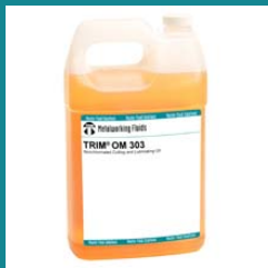
1-gallon jug SKU: OM303-1G UPC-12: 641238005919