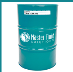
54-gallon drum SKU: OM303-54G UPC-12: 641238005957