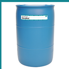
54-gallon drum SKU: SKIDRID-54G UPC-12: 641238036524