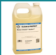
1-gallon jug SKU: SKIDRID-1G UPC-12: 641238036487