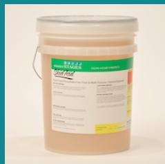
5-gallon pail SKU: SKIDRID-5G UPC-12: 641238036500