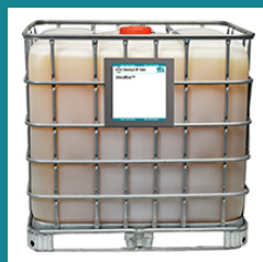
270-gallon tote SKU: SKIDRID-270G UPC-12: 641238036548