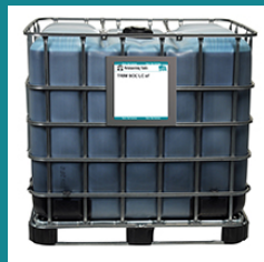
270-gallon tote SKU: SOLLCSF-270G UPC-12: 641238036234