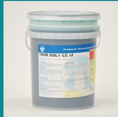
5-gallon pail SKU: SOLLCSF-5G UPC-12: 641238008668