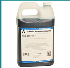
1-gallon jug SKU: SOLLCSF-1G UPC-12: 641238008651