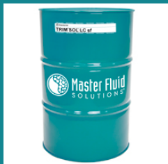
54-gallon drum SKU: SOLLCSF-54G UPC-12: 641238008675