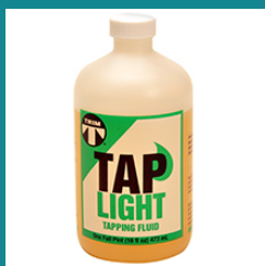
1-pint bottle SKU: TAPLT-1P UPC-12: 641238009221