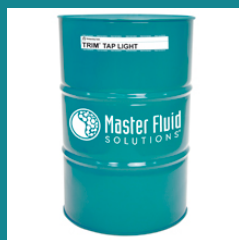
54-gallon drum SKU: TAPLT-54G UPC-12: 641238009191