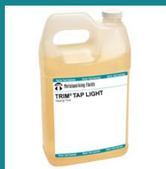
1-gallon jug SKU: TAPLT-1G UPC-12: 641238009139