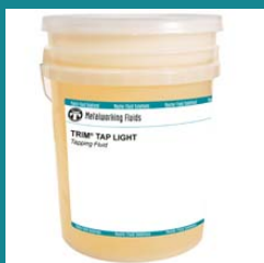
5-gallon pail SKU: TAPLT-5G UPC-12: 641238009184