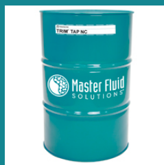
54-gallon drum SKU: TAPNC-54G UPC-12: 641238009399