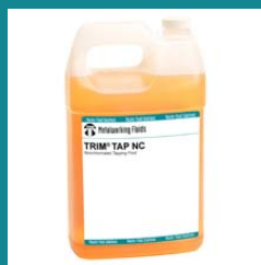
1-gallon jug SKU: TAPNC-1G UPC-12: 641238009337