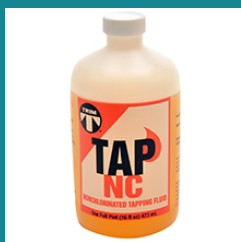
1-pint bottle SKU: TAPNC-1P UPC-12: 641238009429