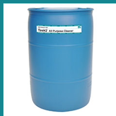
54-gallon drum SKU: TASK2APC-54G UPC-12: 641238047384

Master STAGES™ Task2™ APC | ©2008-2024 Master Fluid Solutions® | 2024-04-16