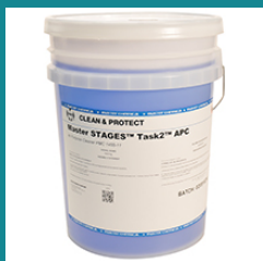
5-gallon pail SKU: TASK2APC-5G UPC-12: 641238000655