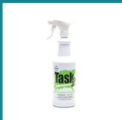
1-quart bottle SKU: TASK2APC-QT UPC-12: 641238047407