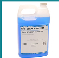
1-gallon jug SKU: TASK2APC-1G UPC-12: 641238000617