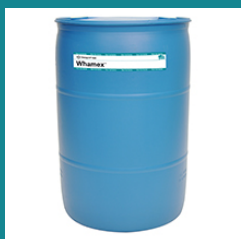
54-gallon drum SKU: WHAMEX-54G UPC-12: 641238027324