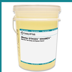
5-gallon pail SKU: WHAMEX-5G UPC-12: 641238027317