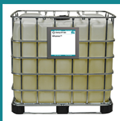
270-gallon tote SKU: WHAMEX-270G UPC-12: 641238033165

Master STAGES™ Whamex™ | ©2004-2024 Master Fluid Solutions® | 2024-05-08