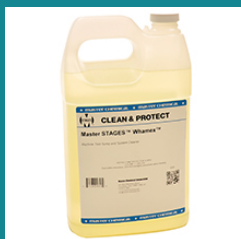
1-gallon jug SKU: WHAMEX-1G UPC-12: 641238027294