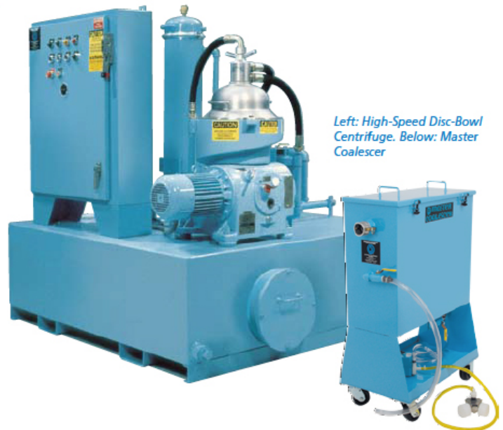
Master Fluid Solutions' XYBEX® High-Speed Disc Bowl centrifuge and XYBEX® Master Coalescer

Coalescers will remove both dispersed and free tramp oil . They are, in effect, special tanks where oleophilic (oil attracting) media or plates coalesce (merge small oil droplets into large oil droplets) the dispersed oil so that it can be skimmed off. These coalescers increase the effective size of the sump and as flow rates are low there is plenty of quiescent time for the oil to "split out" and rise to the surface. Coalescers are very effective when the tramp oils are not readily soluble in the working solution. Even a small amount of detergency in either the fluid or the oil will reduce the effectiveness of a coalescer. The classic use for coalescers is to separate "bilge and ballast" water (often salt water) from residual and spilled oil in the bilges and tanks. The efficiency of coalescers is similar to that of a settling tank with a similar retention time.